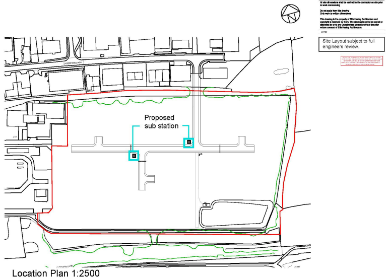
Location Plan 1:2500